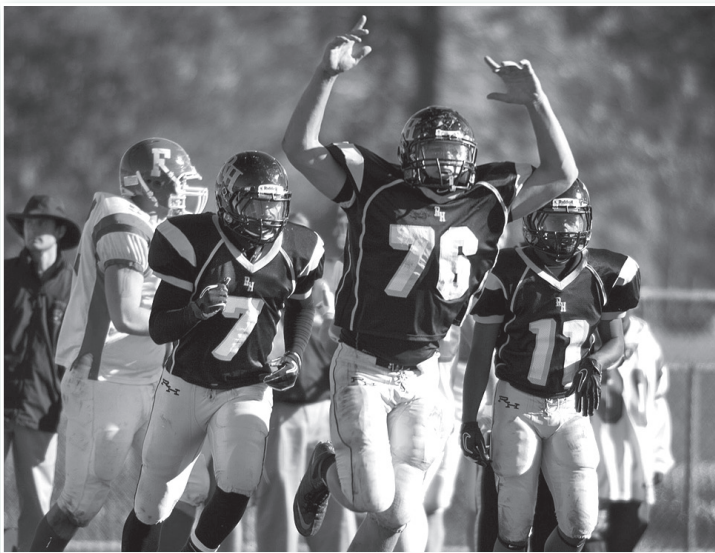
The Rush-Henrietta varsity football team achieved high levels of success on the field and in the classroom.

For any team to be honored, it must meet a state athletic association requirement that a certain number