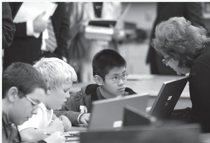
State officials observed differentiated learning at Burger Middle School during a recent visit to the school district.